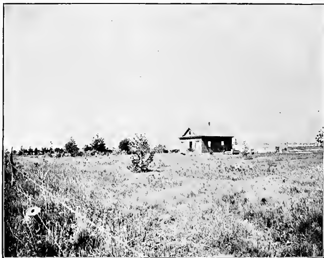
COLONIST'S COTTAGE, FORT AMITY.